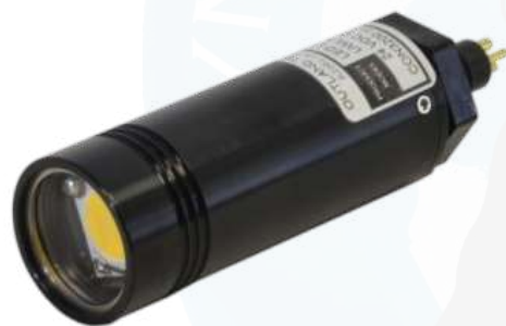
PART NO : SY-UWL-401