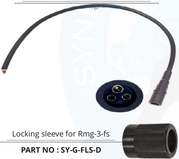
Locking sleeve for Rmg-3-fs